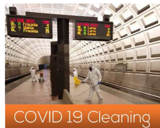
COVID 19 Cleaning