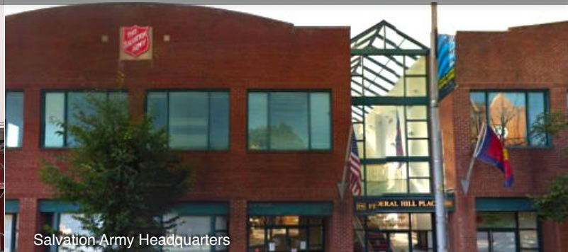
Salvation Army Headquarters