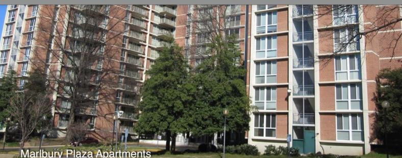
Marlbury Plaza Apartments