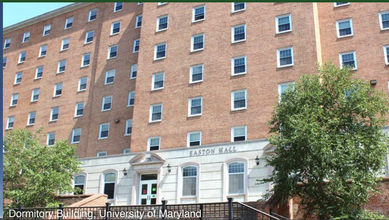
Dormitory Building, University of Maryland