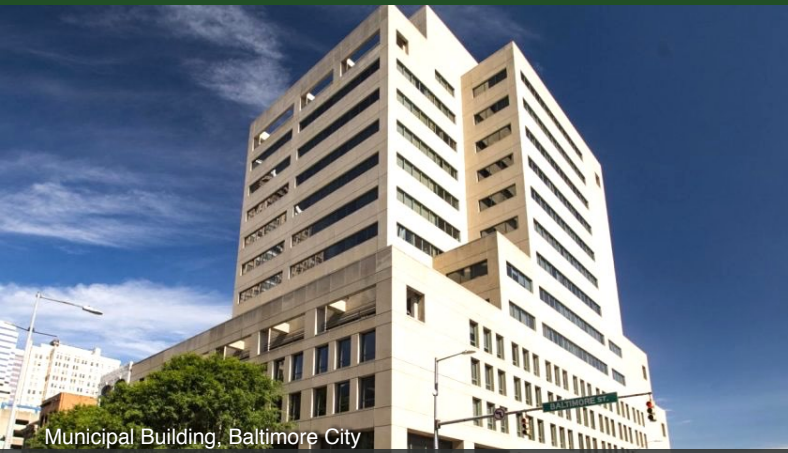
Municipal Building, Baltimore City