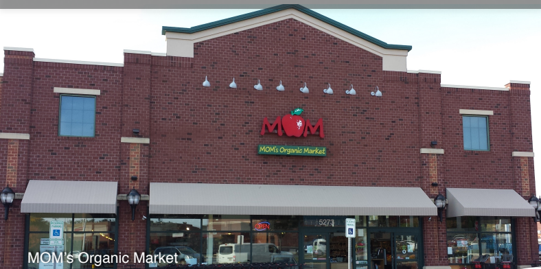
MOM's Organic Market