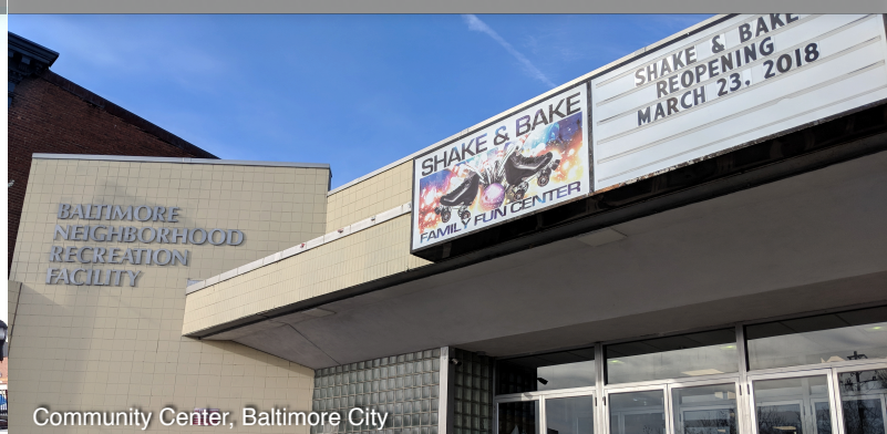
Community Center, Baltimore City